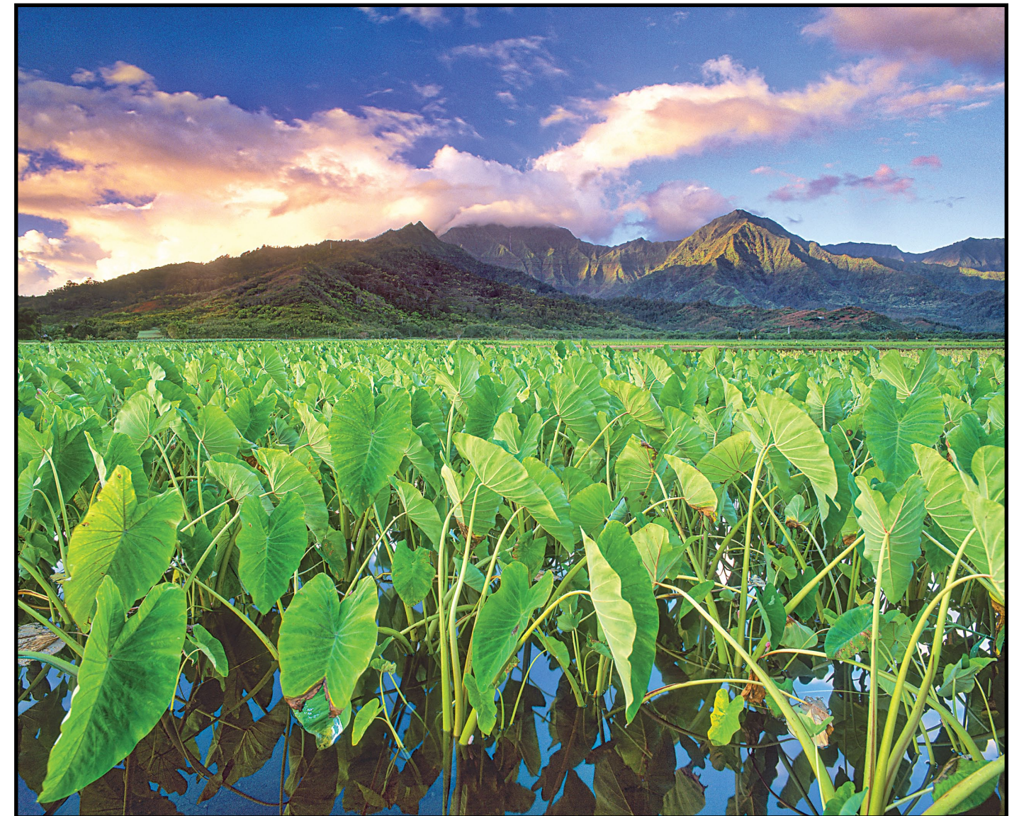
“Hanalei Sunrise Taro 1”

The kalo (taro) plant is life and the symbol of our annual Wellness event